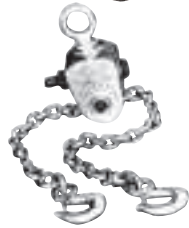
LR2000 908 kg Cap.