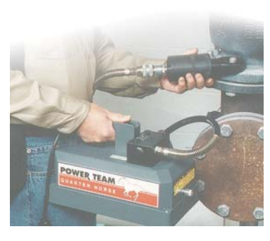
The Quarter Horse pump has a maximum operating pressure of 10,000 psi, which handles a wide variety of handheld hydraulic tools.